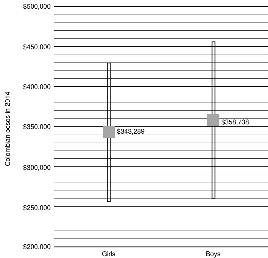
Figure 2. Distribution of the direct costs associated with acute otitis media in pediatric patients

The economic cost (direct medical costs + out-of-pocket expenses + indirect costs) per acute otitis media patient was COP $354,954 (USD $177.5), with a 95%CI of COP $254,419 - COP $455,490 (table 2). From these costs, 63% were direct attention costs, 9% were pocket expenses, and the rest (28%) were associated with indirect costs.